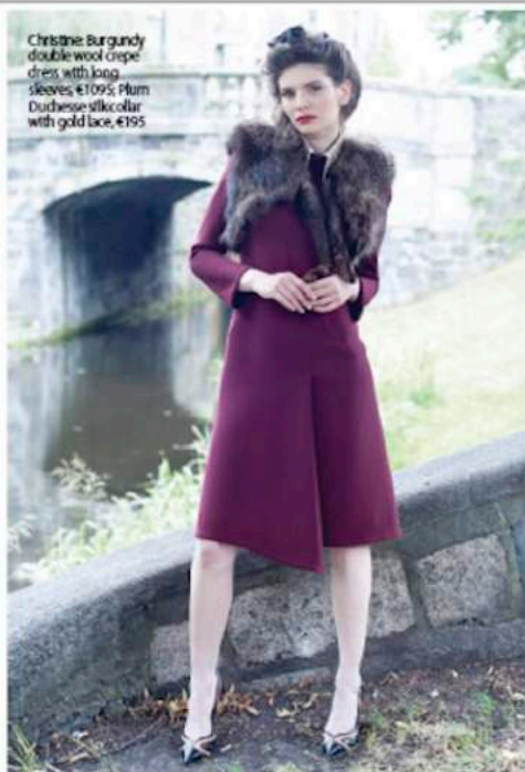
Christine: Burgundy double wool crepe dress with long sleeves, €1095; Plum Duchesse silk collar with gold lace, €195