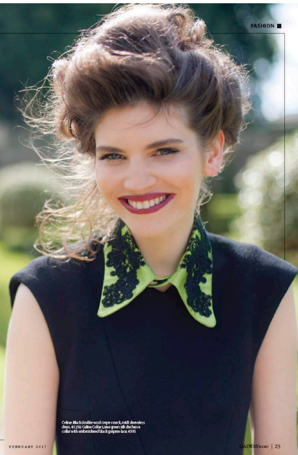
Carline: Black double wool crepe vest, milk sleeveless dress, €1250. Calline: Collar: Lime green silk duchesse collar with embroidered black guipure lace, €195

Available to order at delphinegrandjouan.com or by appointment in Kerry and Dublin, 067 648 8901