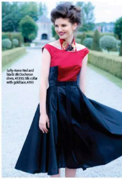
Sally-Anne: Red and black silk Duchesse dress, €1350; Silk collar with gold lace, €195