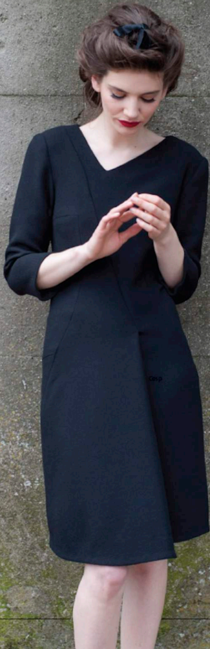
Anne: Black double wool crepe V-neck dress with cropped sleeves, €950