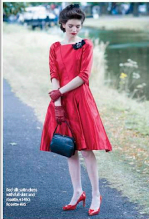
Red silk satin dress with full skirt and rosette, €1450; Rosette €95