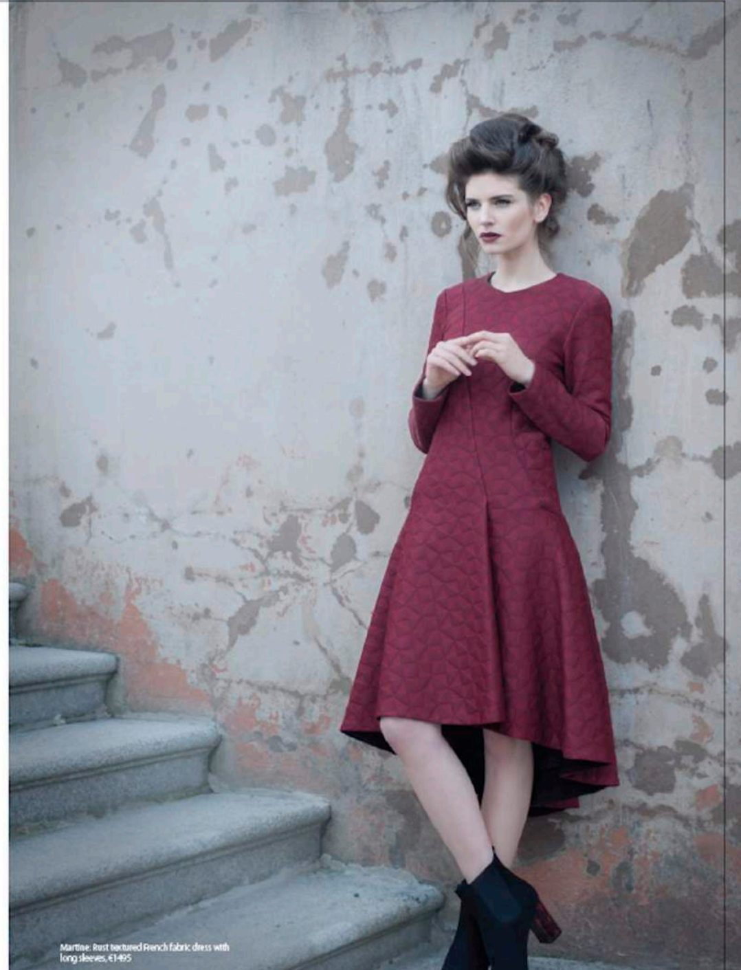
Martise: Rust textured French fabric dress with long sleeves, €1495